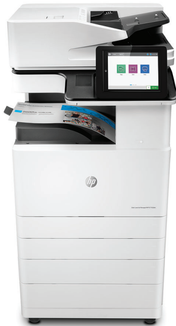
HP Color LaserJet Managed MFP E77830dn

Businesses that stay ahead don't slow down. It's why HP built the next generation of HP Color LaserJet MFPs—to power productivity with a streamlined design that delivers premium color value, maximum uptime, and the strongest security. 1