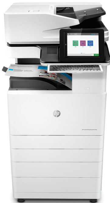
HP Color LaserJet Managed Flow MFP E77830z