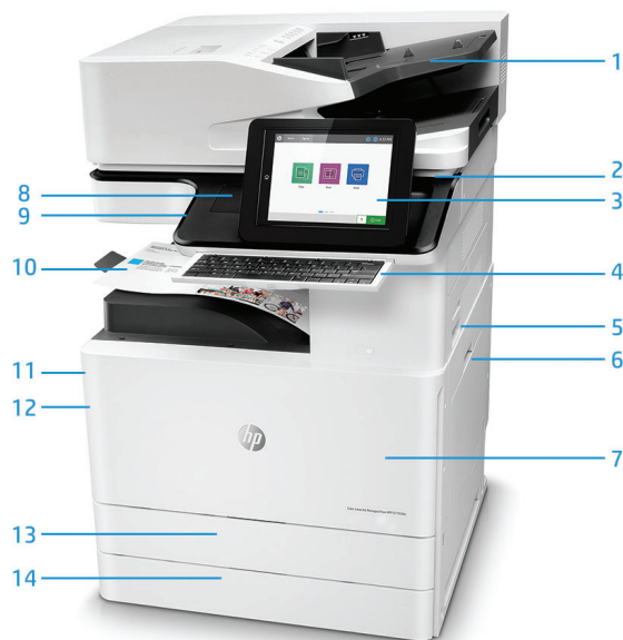
HP Color LaserJet Managed Flow MFP E77830z