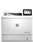
Color LaserJet Managed E55040