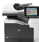
Color LaserJet Managed MFP M775