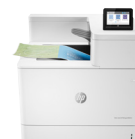
Color LaserJet Managed E85055 Printer