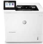
LaserJet Managed E60155