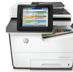
PageWide Managed MFP E58650