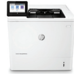
LaserJet Managed E60165