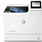
Color LaserJet Managed E65160