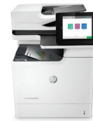
Color LaserJet Managed MFP E67650