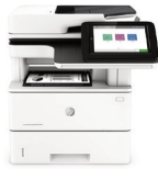
LaserJet Managed MFP E52645