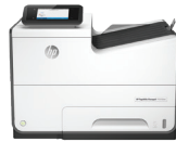
PageWide Managed P55250