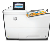
PageWide Managed E55650