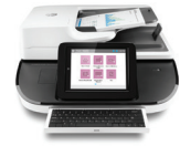
Digital Sender Flow 8500 fn2