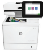
Color LaserJet Managed MFP E57540