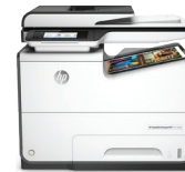
PageWide Managed MFP P57750