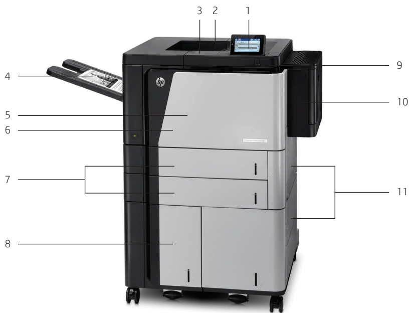
HP LaserJet Enterprise M806x+ Printer shown