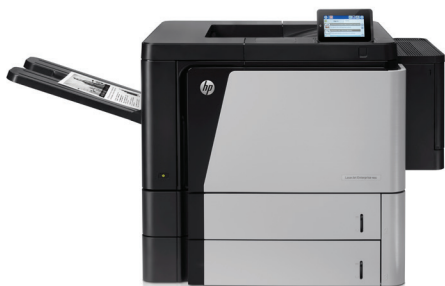
HP LaserJet Enterprise M806dn Printer

This HP LaserJet handles big print jobs fast, with extra-large input capacity and versatile paper-handling options. Mobile printing is simple with wireless direct printing and touch-to-print technology. Easy upgrades protect your investment. 1, 2