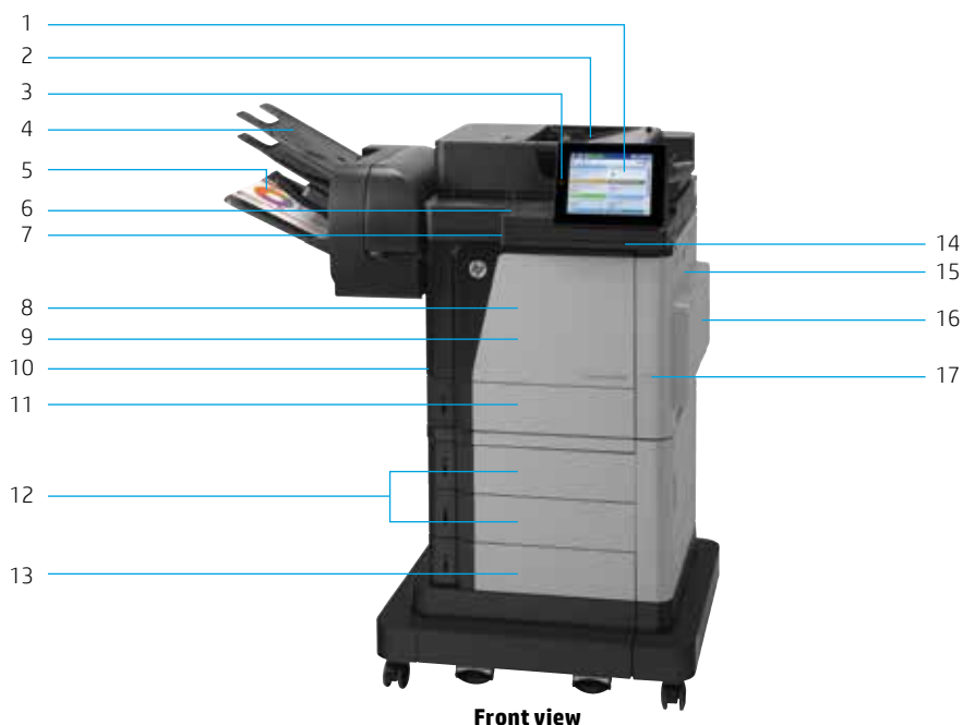
HP Color LaserJet Enterprise Flow MFP M680z shown