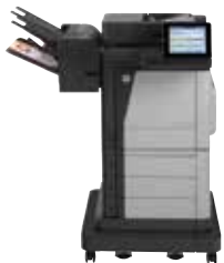
HP Color LaserJet Enterprise Flow MFP M680z